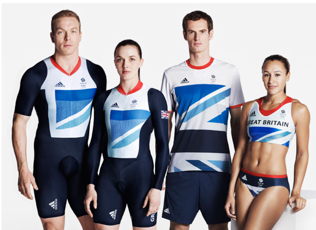
Adidas Team GB Olympic Kit (2012) designed by Stella McCartney

12. Style and function are important when designing sportswear. Comment on this range of designs. In your answer, refer to: