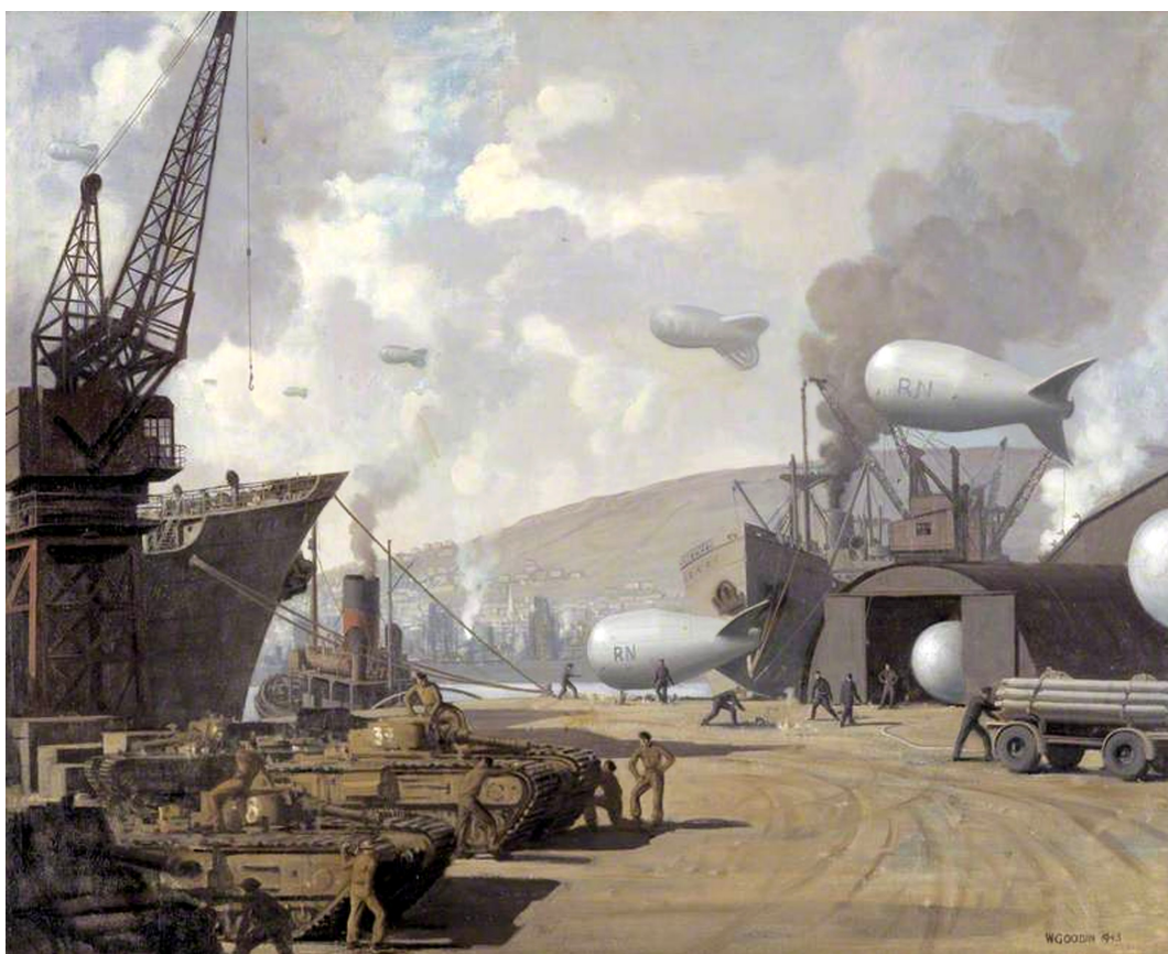
Swansea Docks in Wartime (circa 1940) by Walter Goodin oil on canvas (74 x 92 cm)