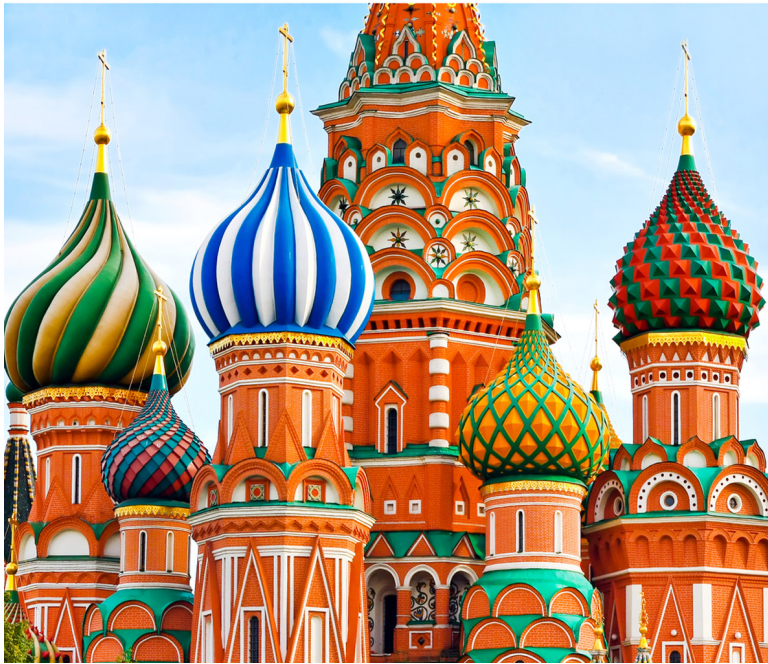
Saint Basil's Cathedral, Moscow (1560) designed by Barma and Postnik Yakovlev Height: 47 metres

10. Architects design buildings which have visual impact. Comment on the design of this building. In your answer, refer to: