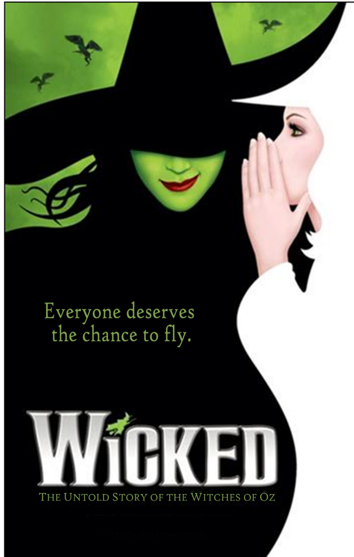
Wicked — poster for musical production (2003) designed by Serino Coyne, Inc

Read your selected question and the notes on the illustration carefully.