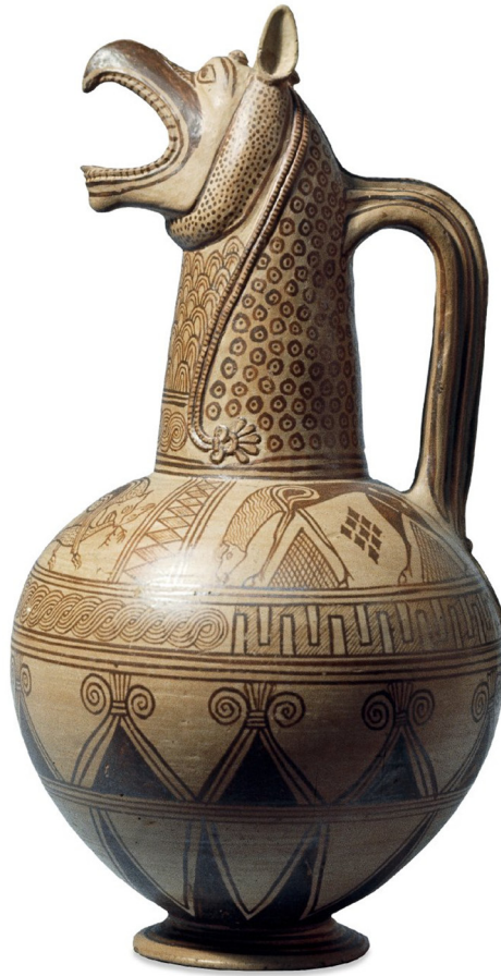
Jug with a griffin-head 1 spout (circa 675 BC – 650 BC) by unknown designer