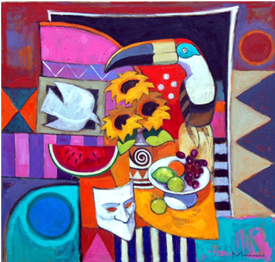
Toucan & Sunflowers (2007) by Jack Morrocco oil on canvas (86 x 91cm)