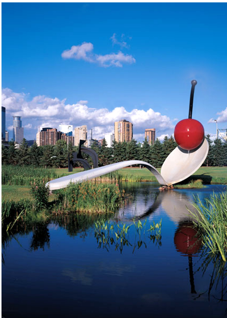
Spoonbridge and Cherry - Minneapolis Sculpture Garden, Walker Art Centre, Minneapolis (1988) by Claes Oldenburg and Coosje van Bruggen stainless steel and aluminium painted with polyurethane enamel (9 x 16 x 4 m)