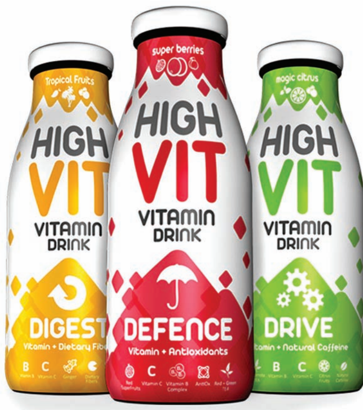
HIGH VIT Juice Drink Bottle (2012) designed by Moon Troops Creative Agency

Read your selected question and the notes on the illustration carefully.