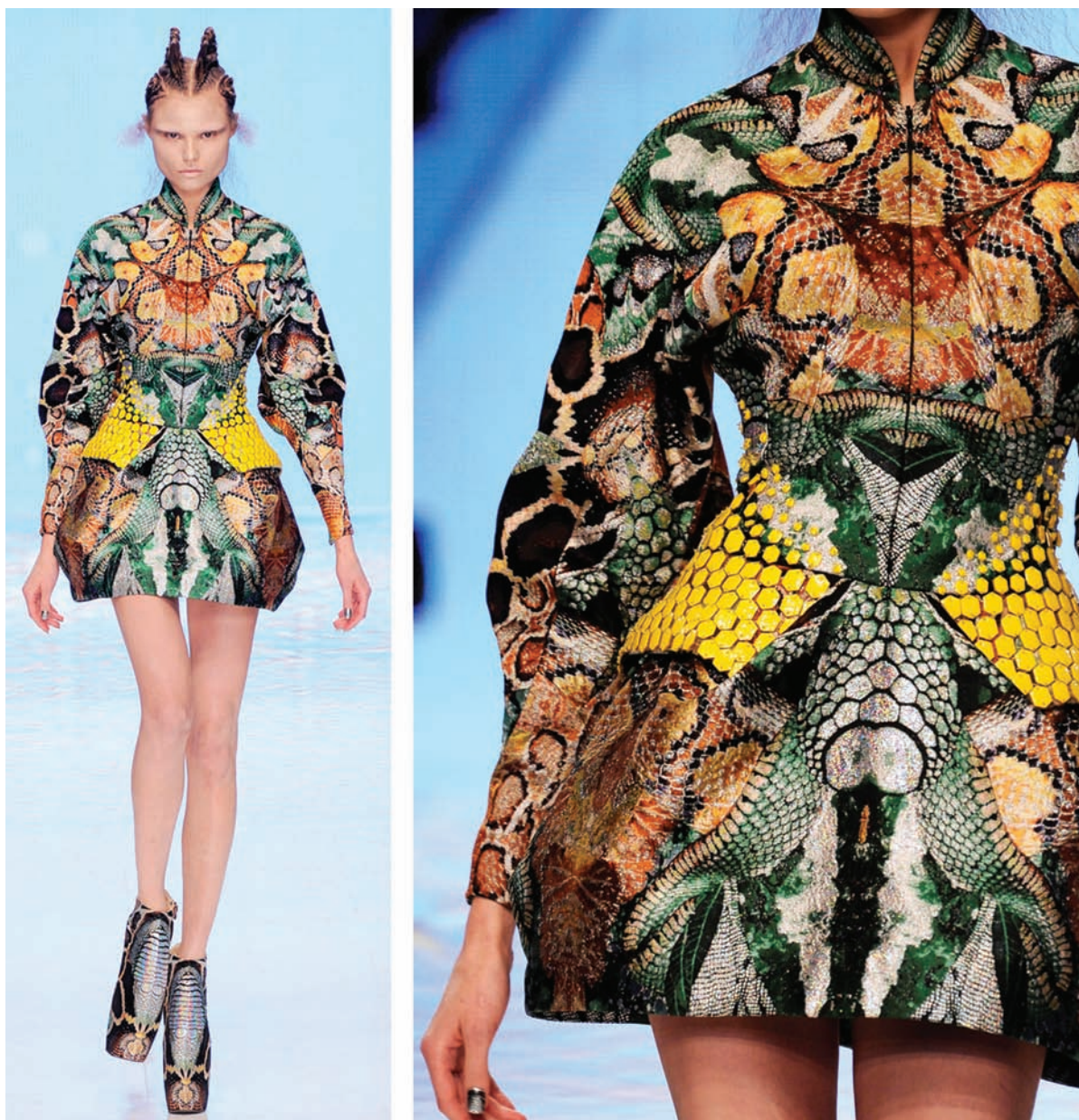
Dress (2010) designed by Alexander McQueen silk with applied decoration

12. Fashion designers use a variety of themes to inspire their work. Comment on this design. In your answer refer to: