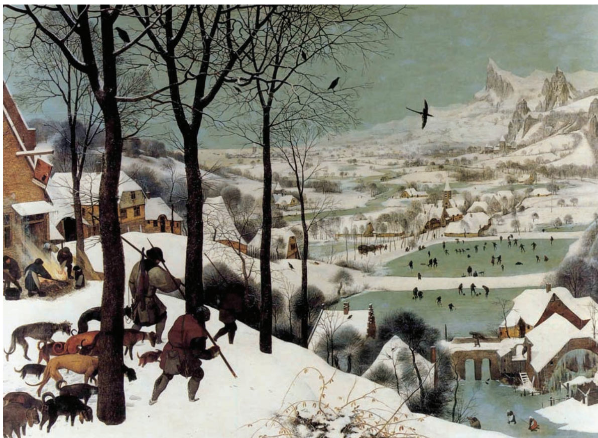
The Hunters in the Snow (1565) by Pieter Bruegel the Elder oil on board (117 x 162 cm)

3. Artists often respond to their surroundings. Comment on how the artist has represented this scene. In your answer, refer to: