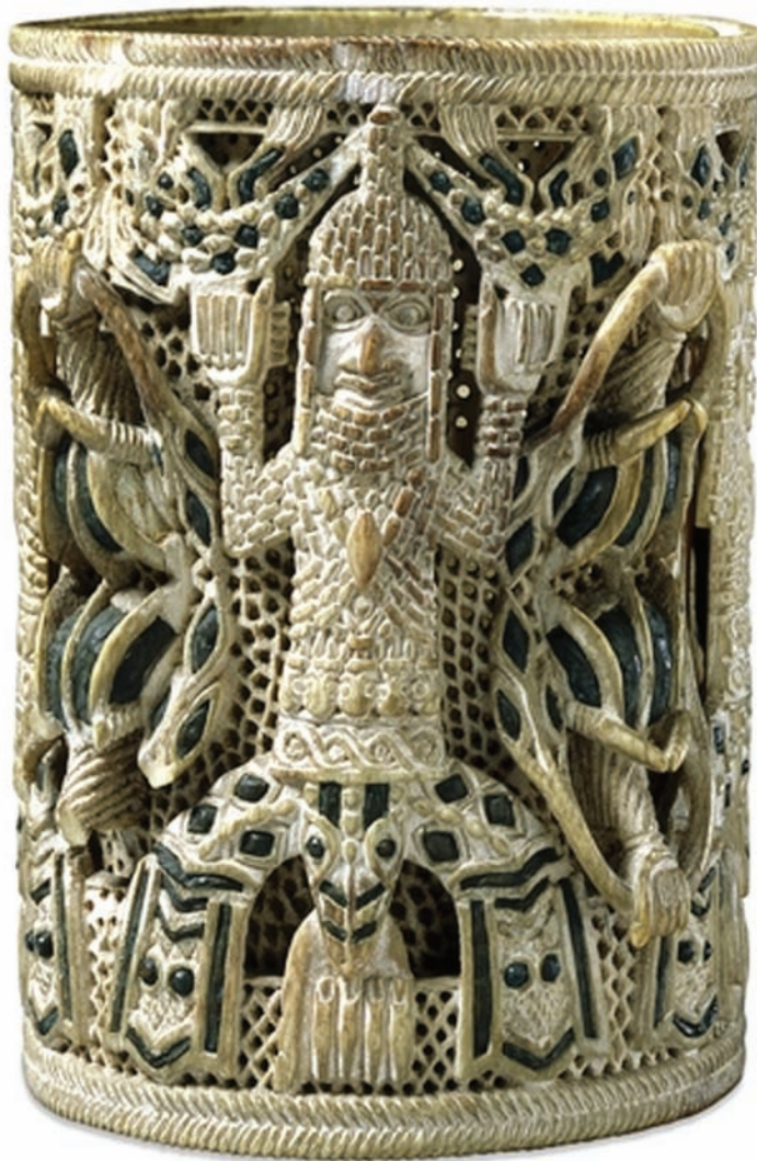
Armlet from Nigeria (15th-16th century AD)

ivory (natural material from elephant tusks) inlaid with coral beads