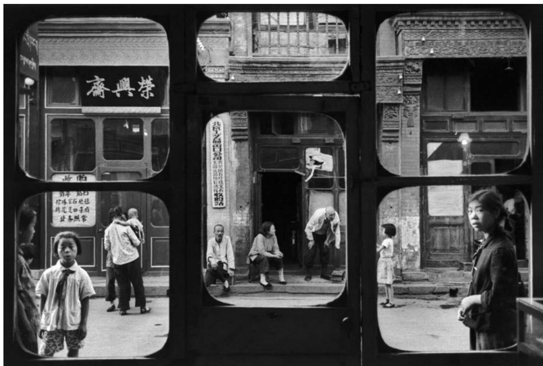
A Street in Beijing, as seen from inside a shop (1965) by Marc Riboud photograph

Read your selected question and the notes on the illustration carefully.