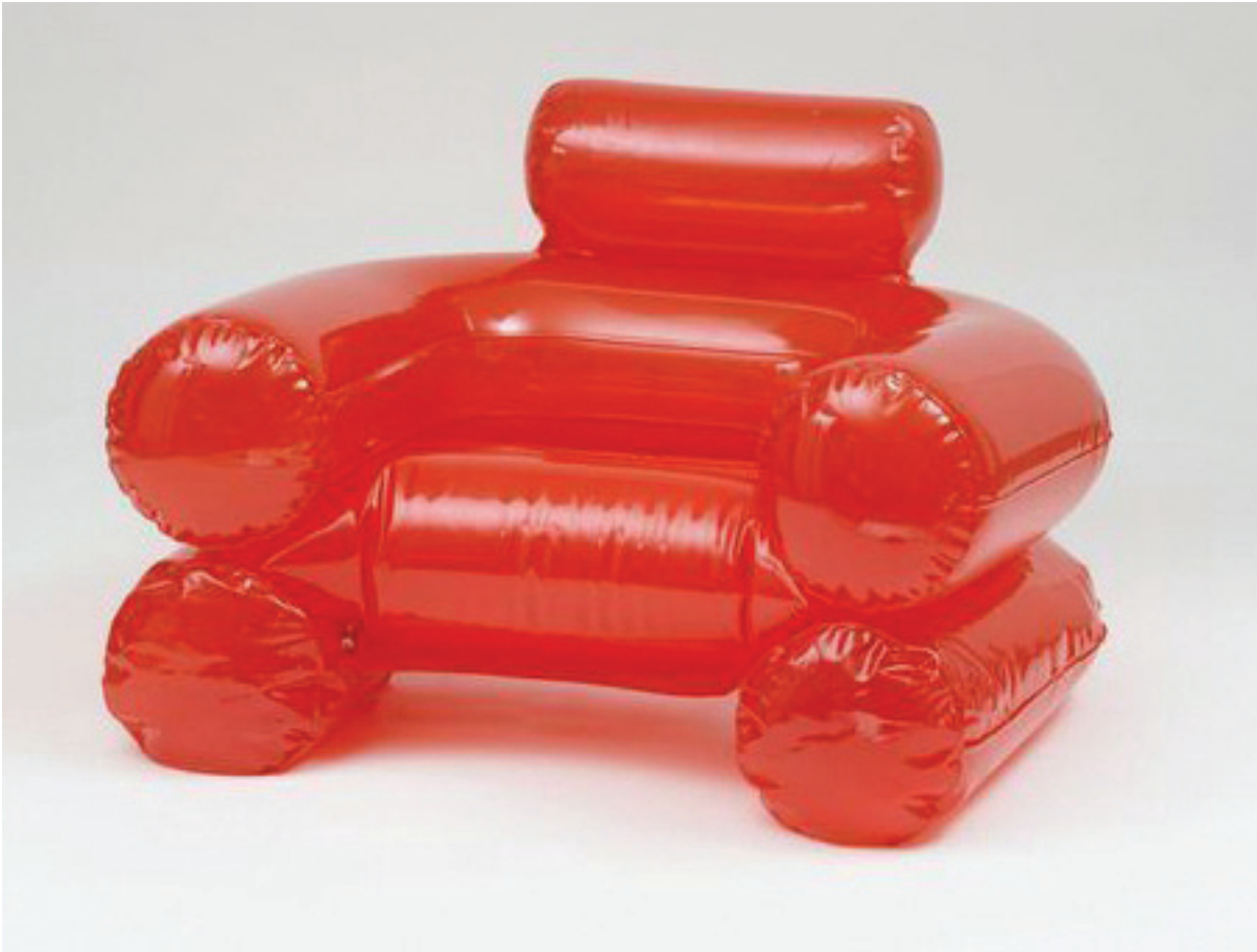
Blow Inflatable Armchair (1967) designed by Paolo Lomazzi, Donato D'Urbino and Jonathan De Pas

PVC plastic (inflated 84 x 120 x 103 cm)