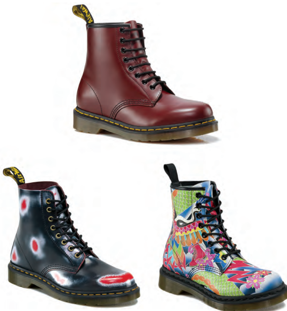
Dr Martens Boots (original boots designed in 1960, patterned boots designed in 2015), designers unknown materials: leather with plastic sole

12. Designers have to create products which appeal to a target audience. Comment on these designs for this range of footwear. In your answer, refer to: