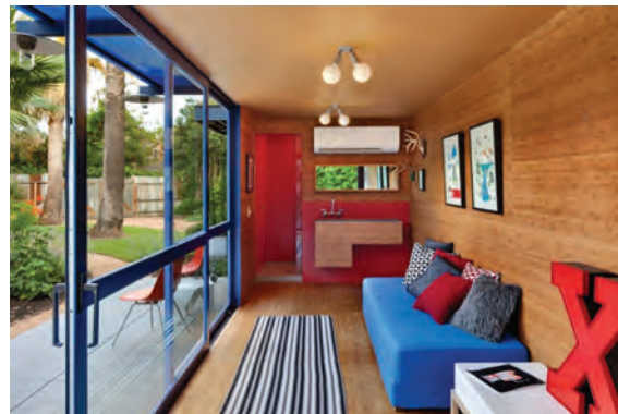
Guest House (2014) designed by Poteet Architects constructed using a recycled shipping container