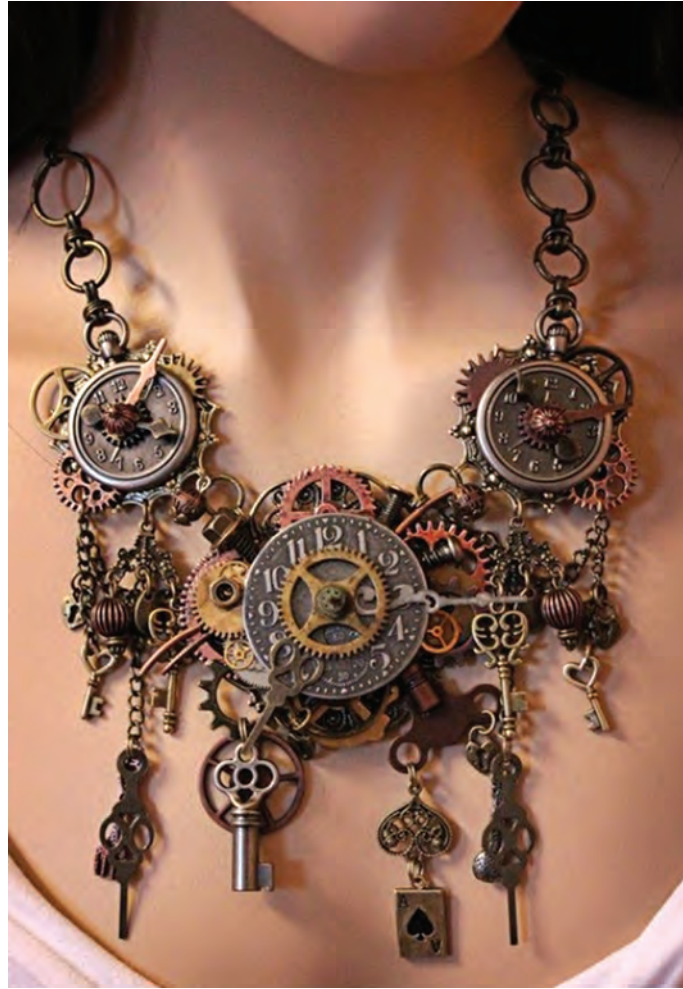
Necklace (2014) by Angela Venable

materials: old keys, watch chains and clock/watch parts