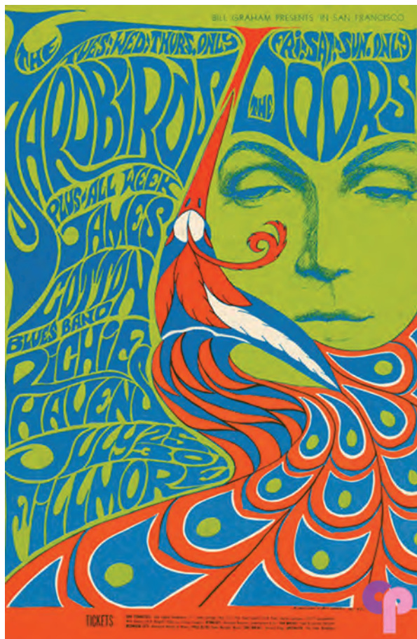
Poster for a musical concert (1967) designed by Bonnie MacLean lithograph 1 (54 × 35.5 cm)

Read your selected question and the notes on the illustration carefully.