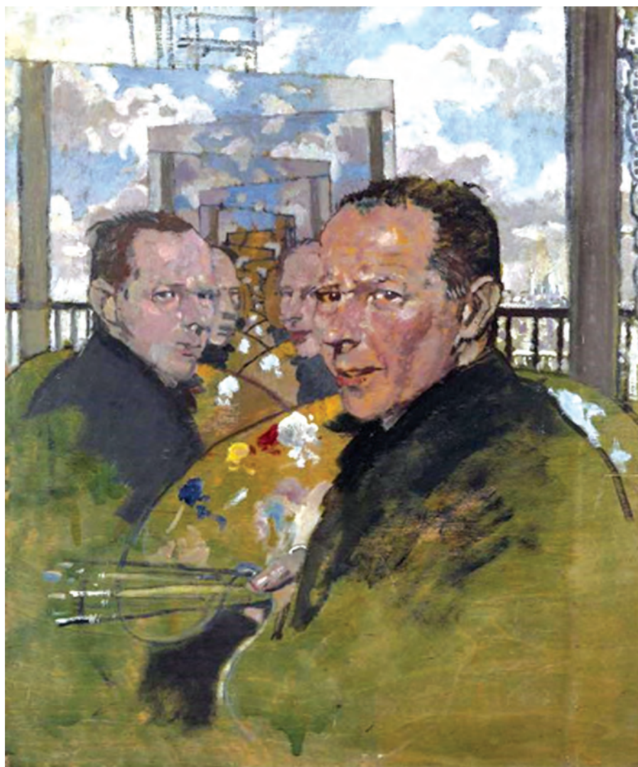
Self Portrait (circa 1924) by William Orpen oil paint on wood panel (79 × 65 cm)