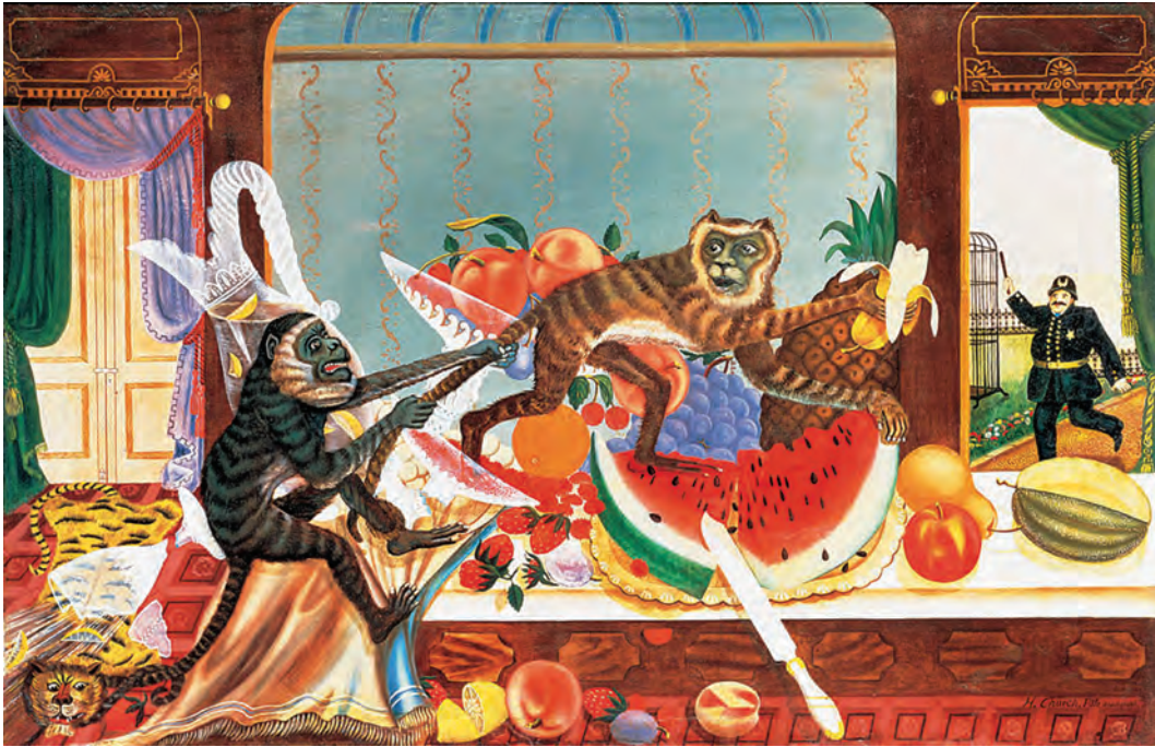
The Monkey Picture (1895–1900) by Henry Church oil paint on canvas (50 × 60 cm)