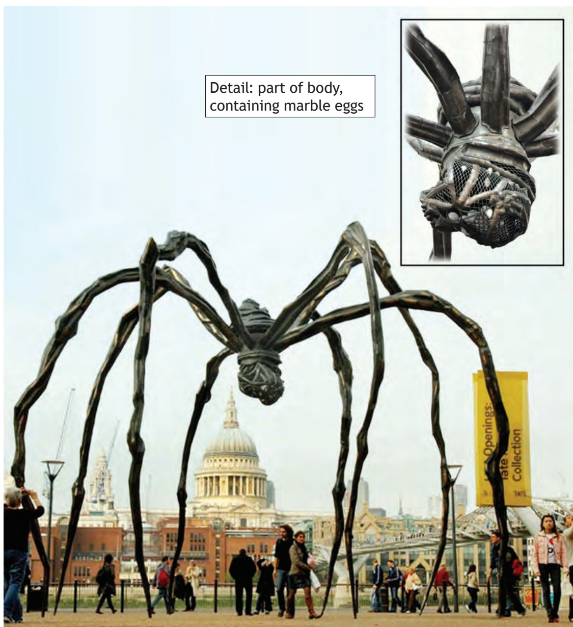
Maman 1 (1999) Louise Bourgeois stainless steel and marble (9 × 9 × 10 m)