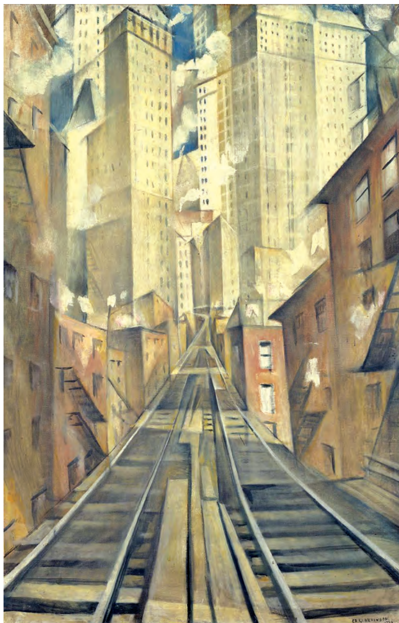
The Soul of the Soulless City (1920) by Christopher Wynne Nevinson oil paint on canvas (92 × 61 cm)

Read your selected question and the notes on the illustration carefully.