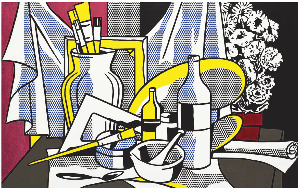
Still Life with Palette (1972) by Roy Lichtenstein oil on canvas (152 × 243 cm)

4. Artists have often experimented with new ways of representing everyday objects. Comment on how the artist has responded to this still life. In your answer, refer to: