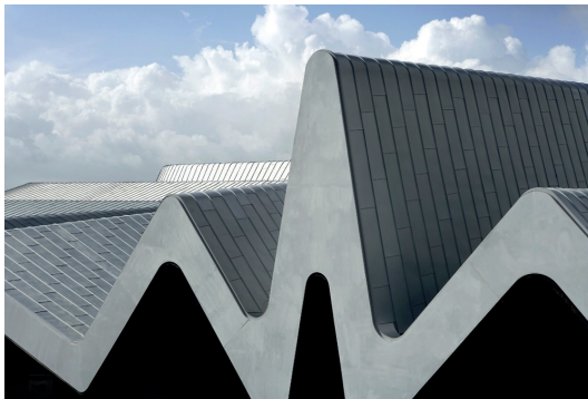
detail of roof