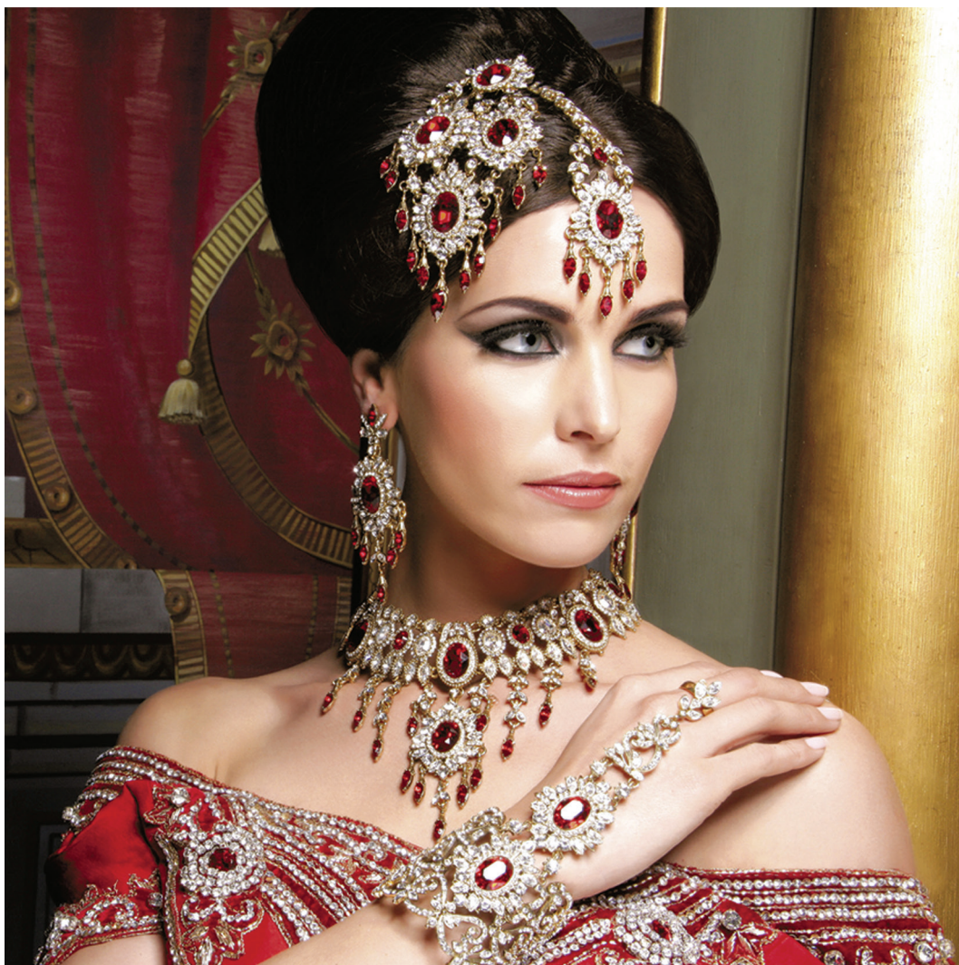
Wedding jewellery set (2015) by an unknown designer gold and semi-precious crystal

11. Jewellery can be designed for a variety of occasions. Comment on this design. In your answer, refer to: