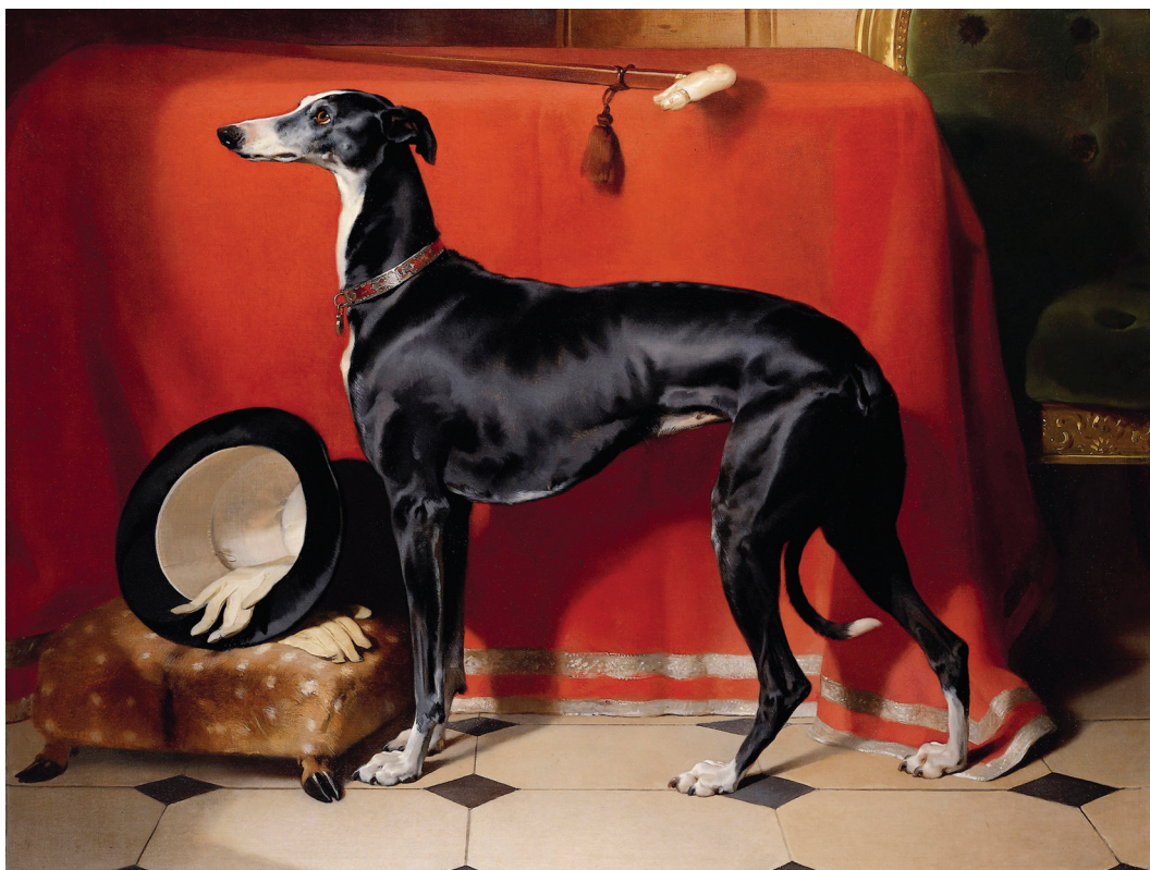
Eos, A Favourite Greyhound of Prince Albert (1841) by Sir Edwin Henry Landseer oil on canvas (112 × 143 cm)