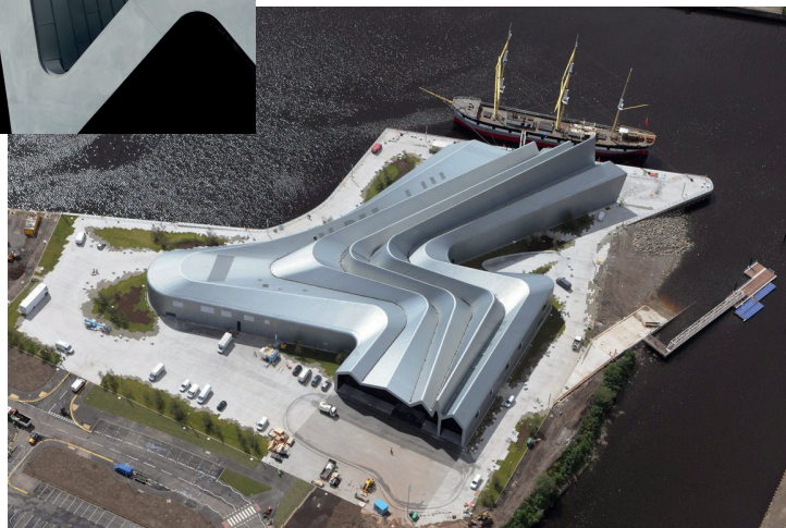
Riverside Museum, Glasgow (2011) designed by Zaha Hadid materials: steel frame, zinc cladding and glass

10. Buildings are designed for different purposes. Comment on this design for a museum. In your answer, refer to: