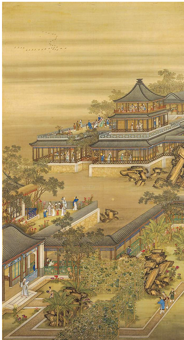
The Emperor Enjoying Himself (1723–1735) by an unknown artist paint on silk fabric (188 × 102 cm)

Read your selected question and the notes on the illustration carefully.