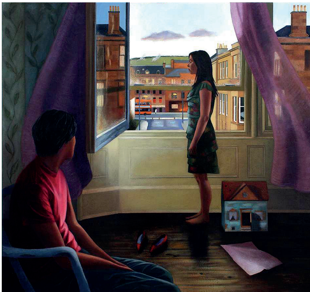
The Doll's House (2007) by Lesley Banks