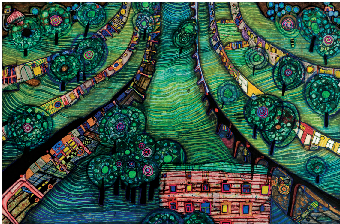
Green Town (1973–1978) by Friedensreich Hundertwasser Watercolour and oil paint on paper (97 x 145 cm)

6. Comment on this painting, referring to