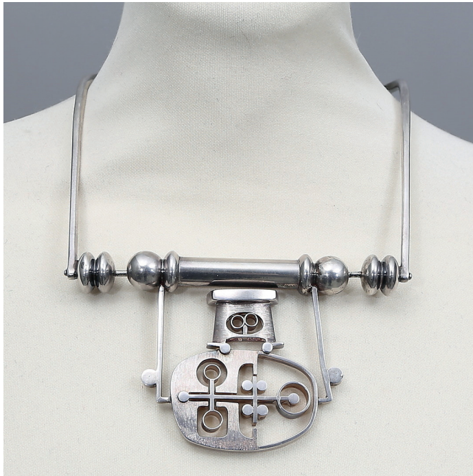
Necklace (1969) by Claës Gierdda