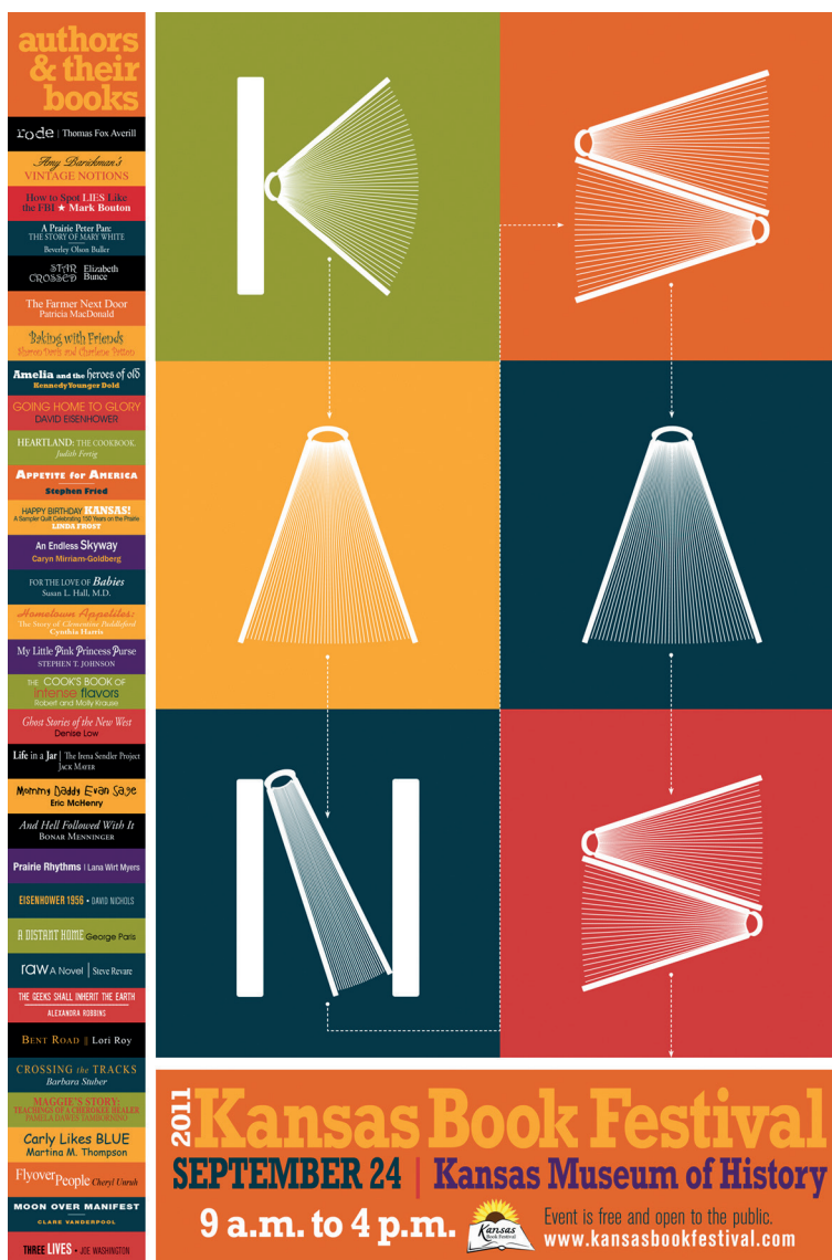
Kansas Book Festival poster design (2011) by an unknown designer

8. Comment on this poster design, referring to