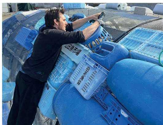
Sculpture during construction

Skyscraper (The Bruges Whale) (2018) by StudioKCA