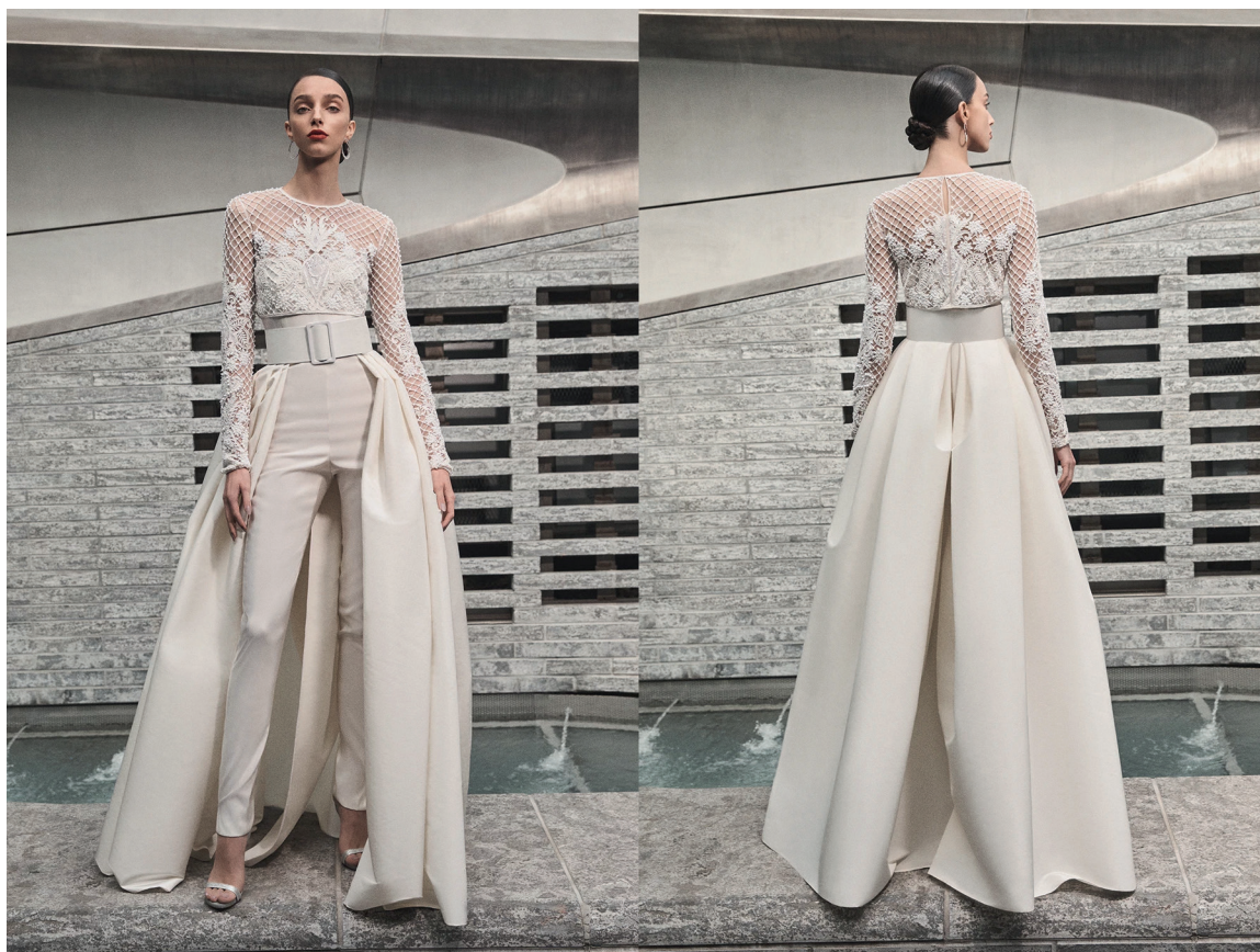
Bridal jumpsuit with detachable belted skirt (2019) by Naeem Khan Materials: silk, lace, embroidered details and crystal beads

12. Comment on this bridal outfit, referring to: