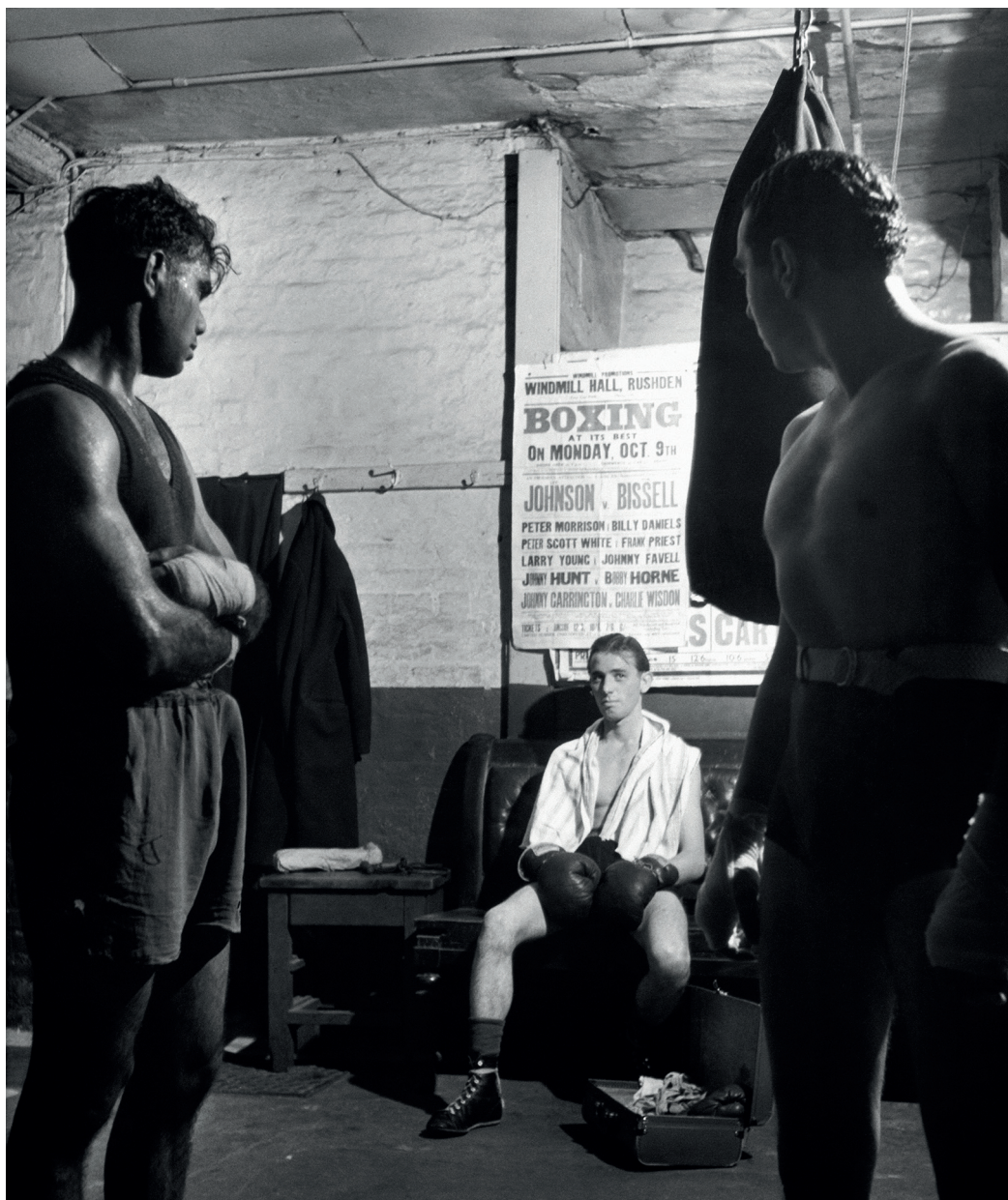
Boxing (1950) by Robert Doisneau