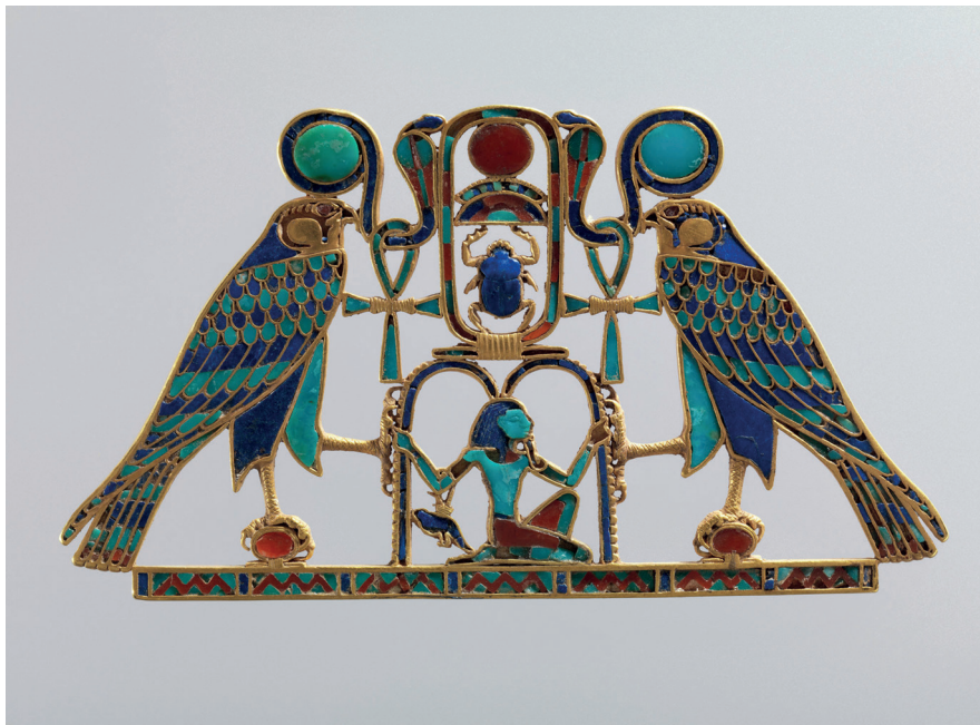
Detail of pendant

Ancient Egyptian Necklace (approximately 4000 years old)