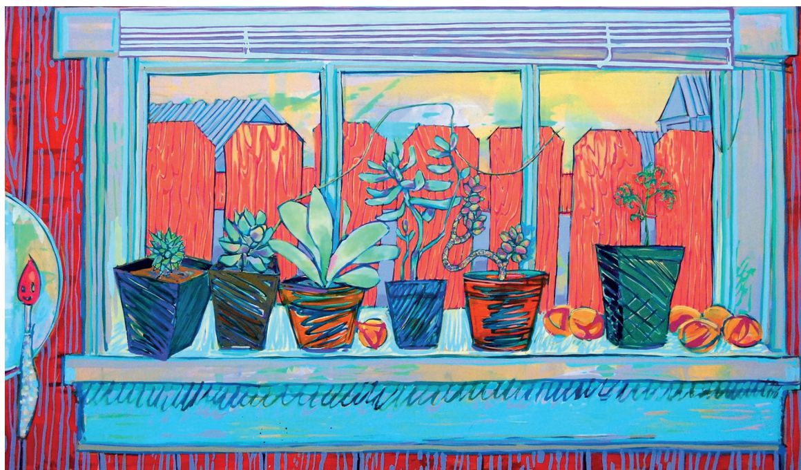
West Coast Love Affair (2017) by Hope Gangloff Acrylic on canvas (91 x 160 cm)

2. Comment on this painting, referring to: