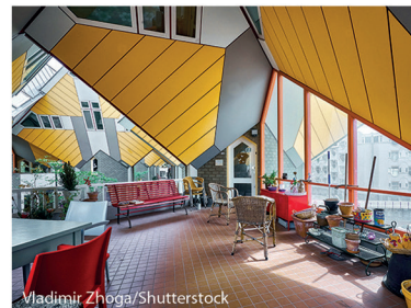
Cube Houses, Rotterdam (1977) by Piet Blom