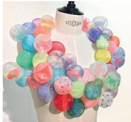
Capsule Necklace (2016) by Mariko Kusumoto Materials: heat set polyester fibre (40 × 30 cm)

11. Comment on this necklace design, referring to: