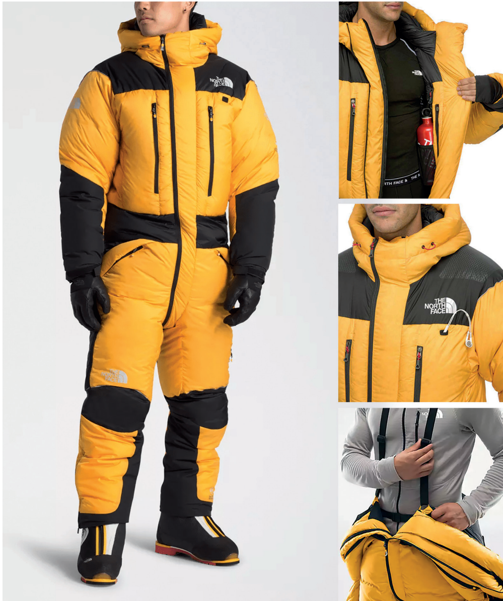
Himalayan Suit (2011) by The North Face

Materials: 800 fill goose down 1 , 100% nylon ripstop fabric 2