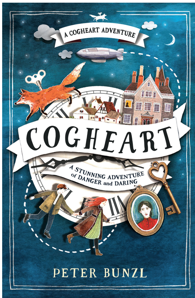
Cogheart book cover (2016) by Becca Stadlander

8. Comment on this book cover design, referring to: