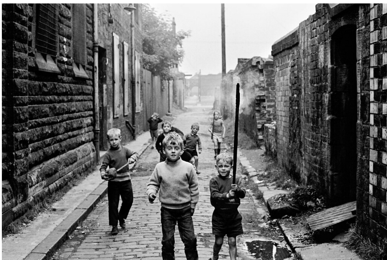
An Eye on the Street, Glasgow (boys in back lane with burning stick) (1968) by David Peat black and white photograph (25 × 38 cm)

3. Comment on this photograph, referring to: