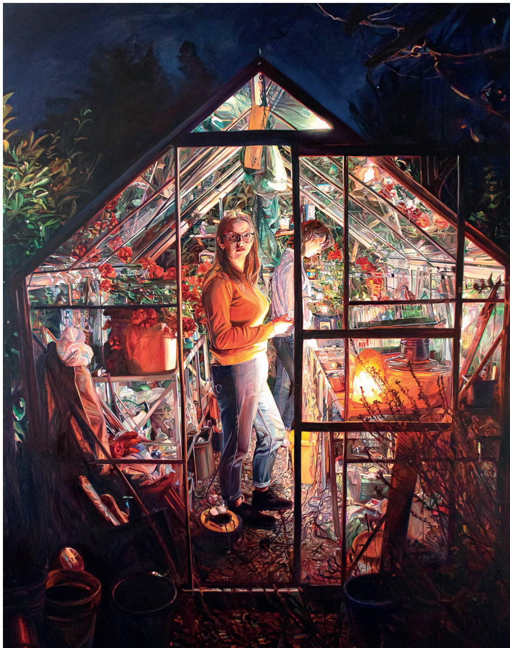
Geraniums (2018) by Ruth Murray oil paint on canvas (190 × 150 cm)

5. Comment on this painting, referring to: