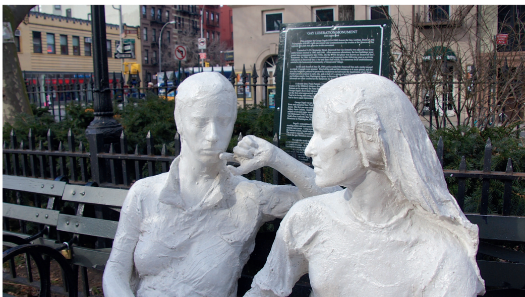
Gay Liberation (1980) by George Segal painted bronze (life-size)

6. Comment on this sculpture, referring to: